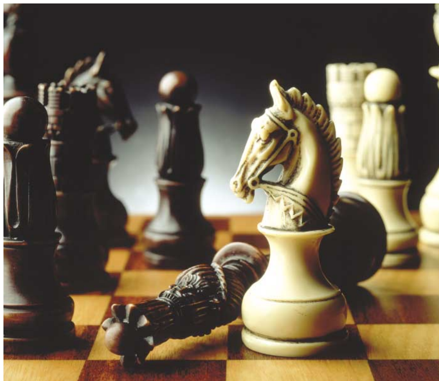
Strategic submissions: playing the game has become all-important.

Evaluations of scientists depend on numbers of papers, positions in lists of authors, and journals' impact factors. In